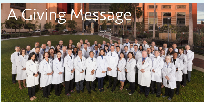
Orange Coast magazine photo with several of the 150 UCI doctors named 2019 "Physician of Excellence," seen here in front of UCI Douglas Hospital in Orange.